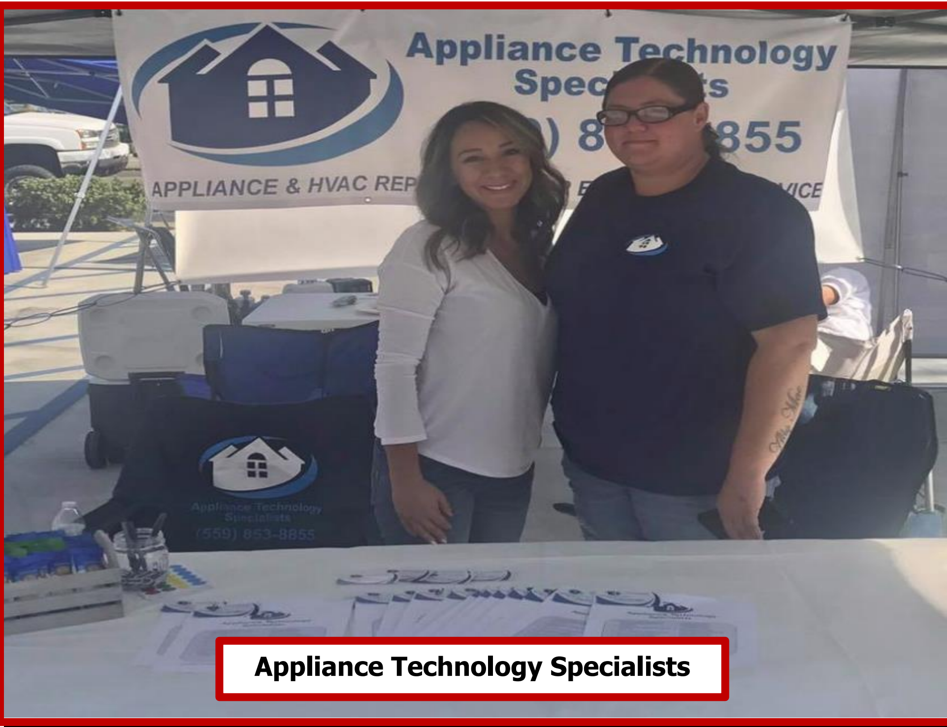
Appliance Technology Specialists