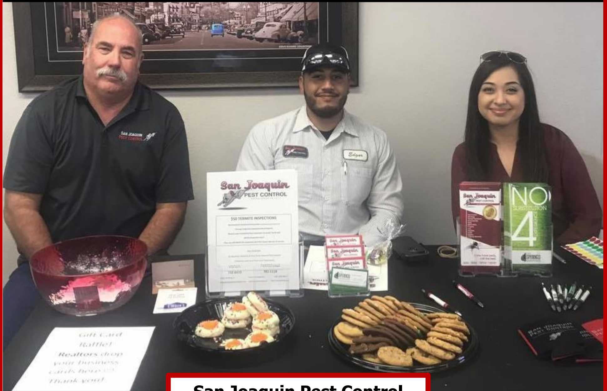
San Joaquin Pest Control