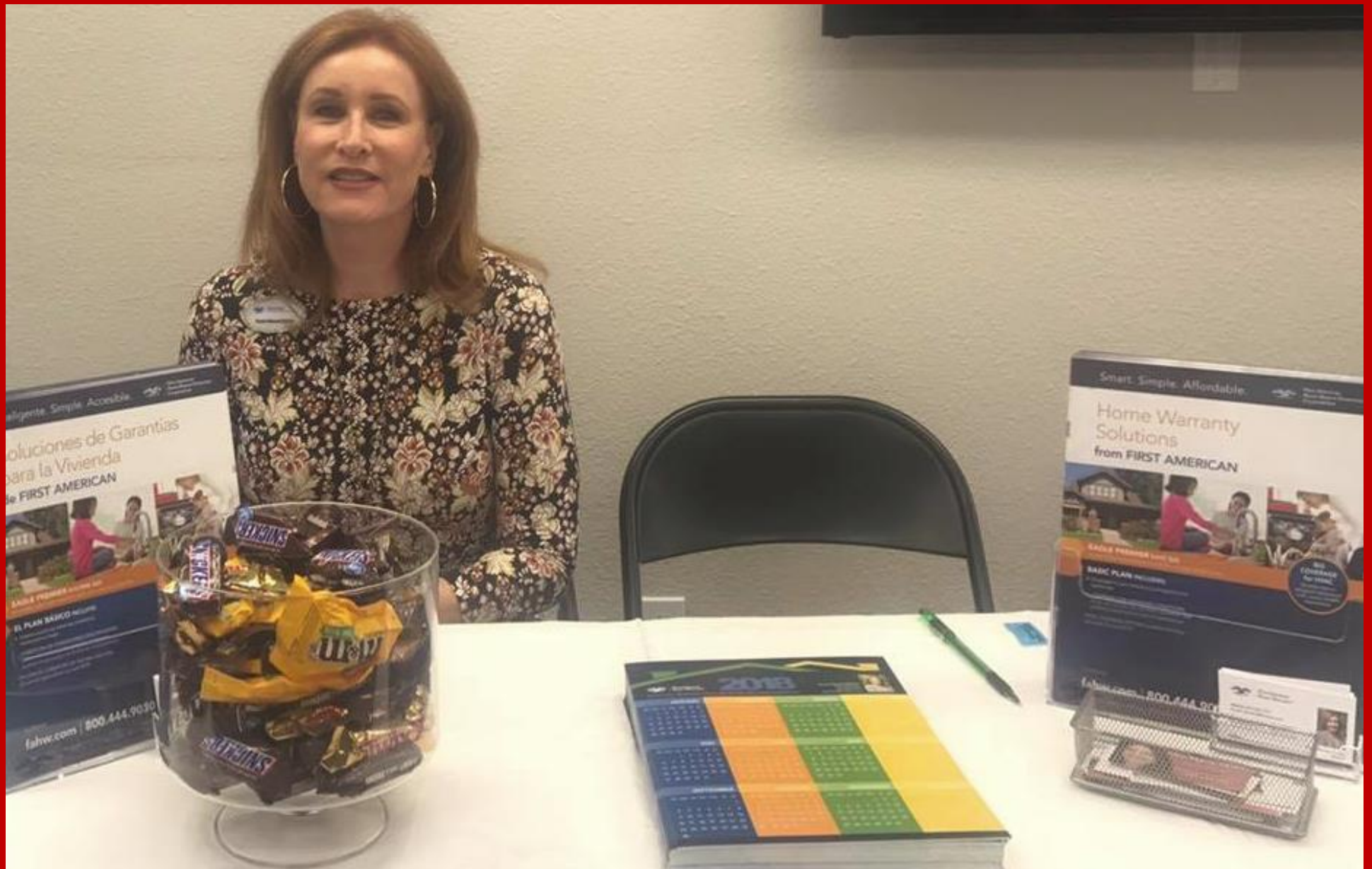
First American Home Buyers Protection Corporation