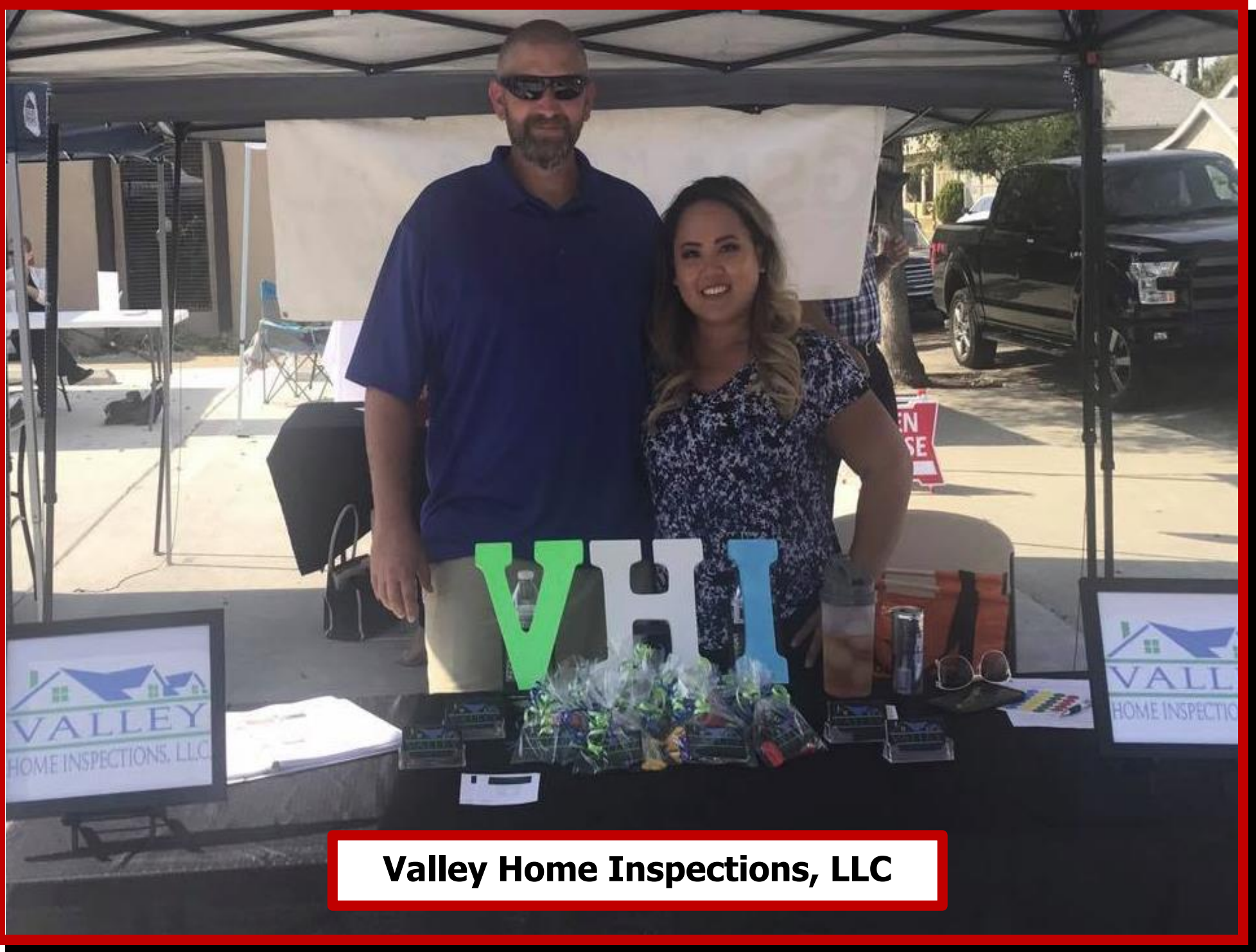
Valley Home Inspections, LLC