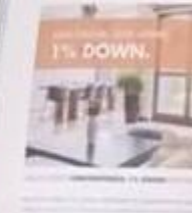
Buwalda Mortgage Services, Inc