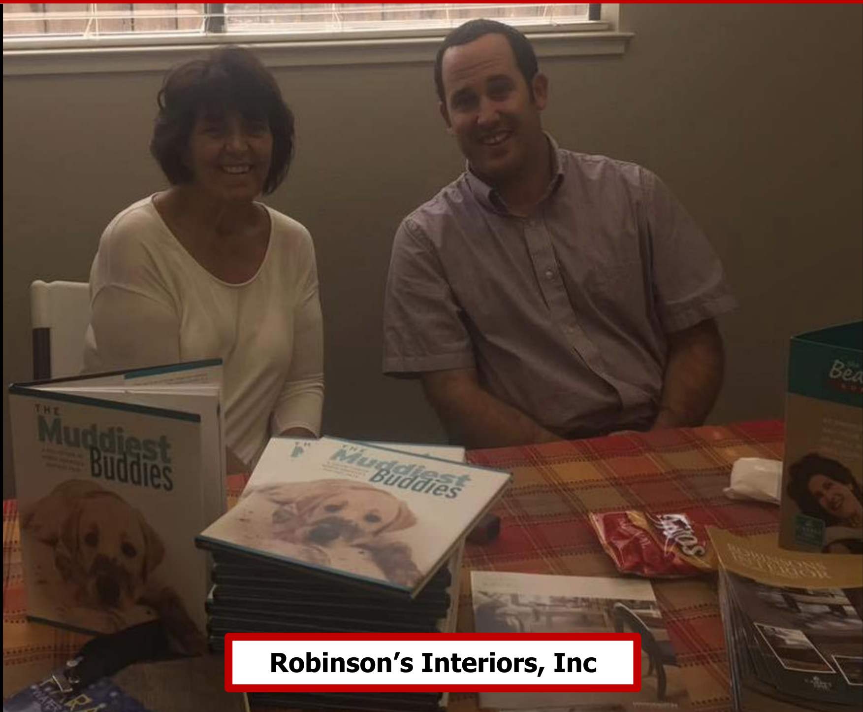
Robinson's Interiors, Inc